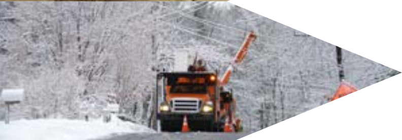
Winter 2021 Storm Event in Texas