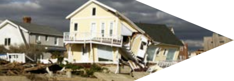
Appraisals in Hurricane Alley